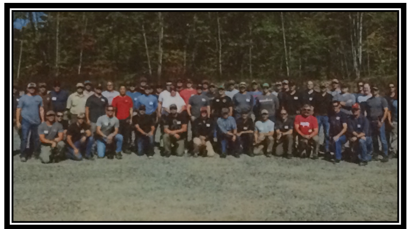
Sig Sauer Range Day, 2016

This year, we are excited to bring back many of the great features from previous years, including the pre-event breakfast, range station rotation (including shotgun, automatic weapon and tower stress course stations) and post-event dinner at the Holy Grail restaurant. Once again, we will also host a family-friendly lunch the day after the event (Saturday, October 14) for those who are interested in spending a little time enjoying the beautiful fall foliage in New Hampshire's White Mountains.