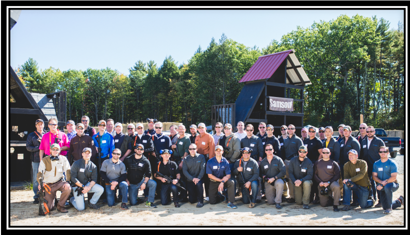
Sig Sauer Range Day, 2015