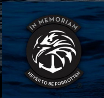
DANIEL TREVOR DALTON SO2 (SEAL) September 17, 2022