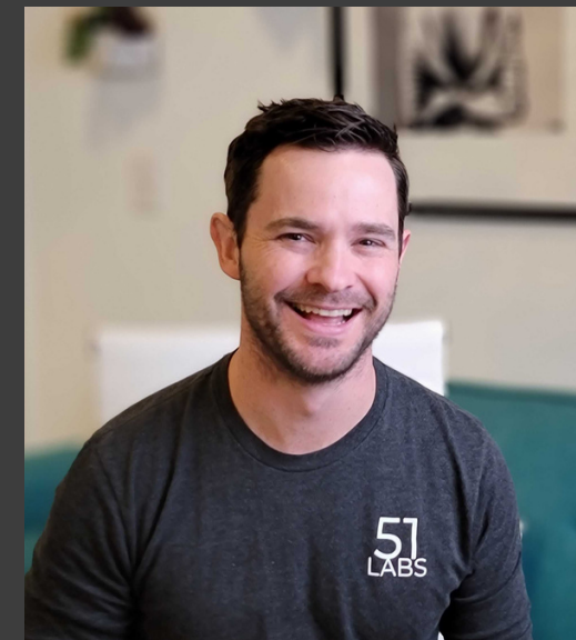
Jordan Entrepreneur Founder